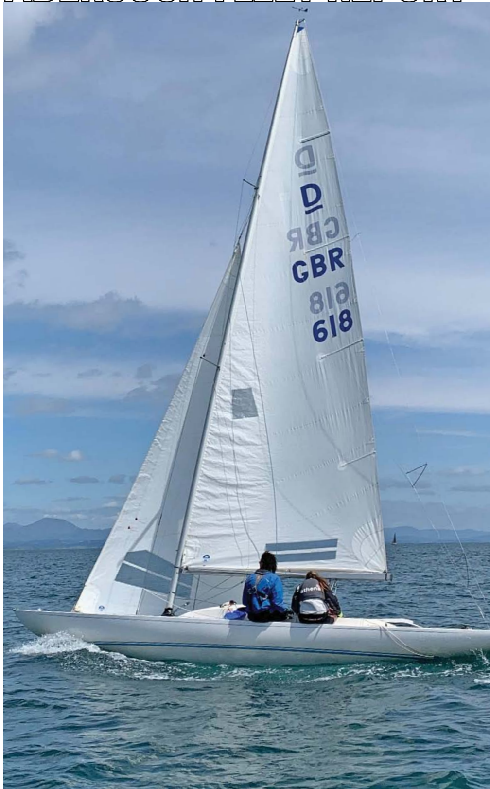
Caramba, winner of the Captain's Cup