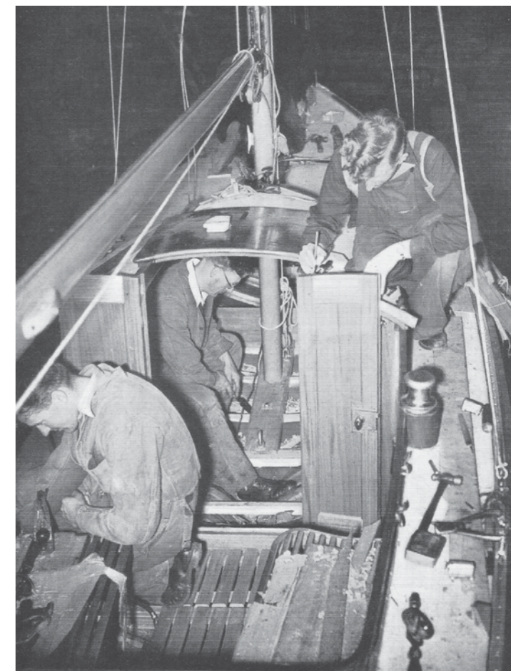
Building the original Bluebottle at Campers & Nicholson