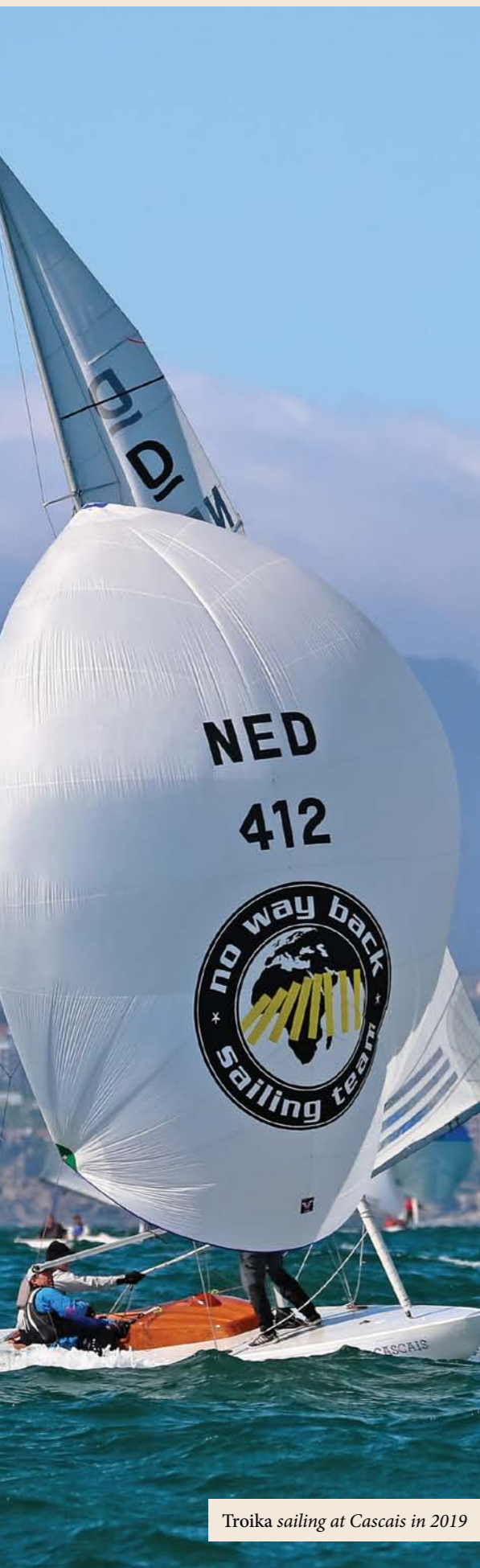
Troika sailing at Cascais in 2019