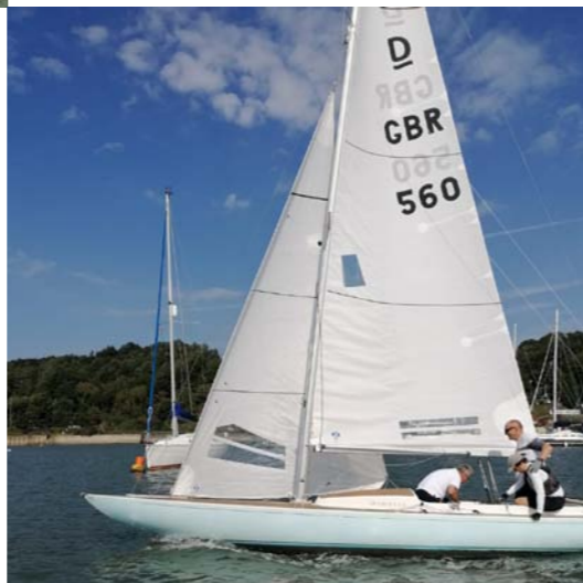
Medway Dragon Champion 2021, Whistle.