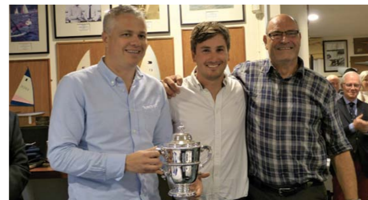
Edinburgh Cup Winners 2021 Badger GBR810